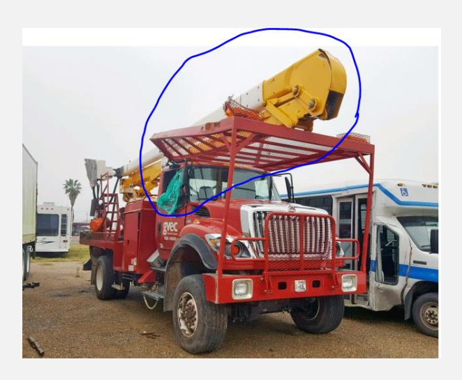
Salvaged commercial boom truck.