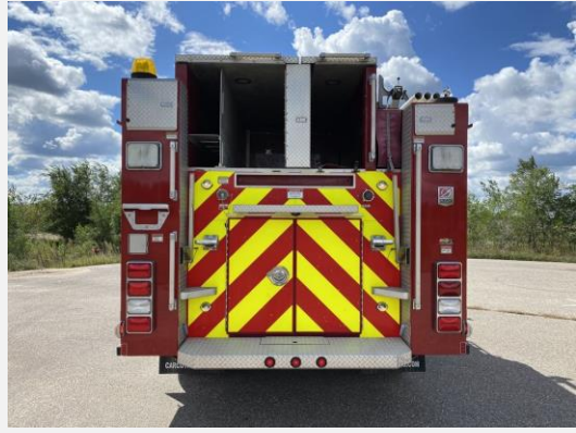
Salvaged commercial boom truck "Reconstructed" into Fire Truck.

Note: Due to statutory exemptions, this vehicle will receive a "Reconstructed" brand following inspection, removing all reference to its salvage history. The seller is also not required to disclose the salvage history to the buyer.