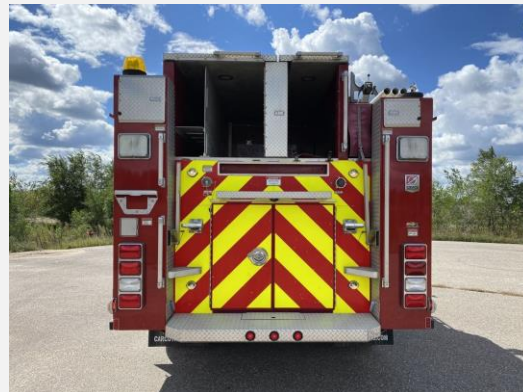
Salvaged commercial boom truck “Reconstructed” into Fire Truck.

Note: Due to statutory exemptions, this vehicle will receive a “Reconstructed” brand following inspection, removing all reference to its salvage history. The seller is also not required to disclose the salvage history to the buyer.