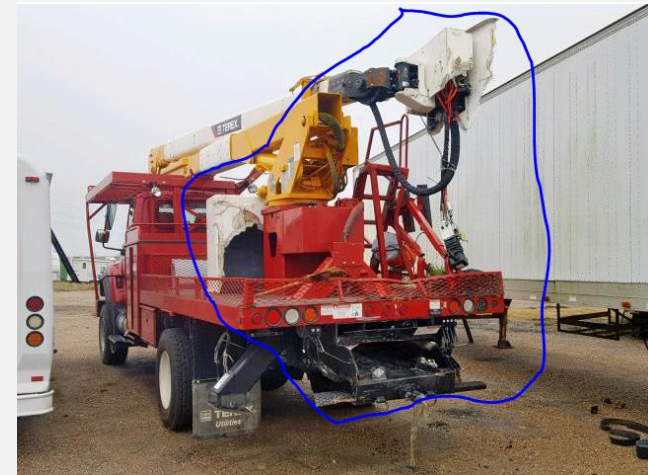
Salvaged commercial boom truck.