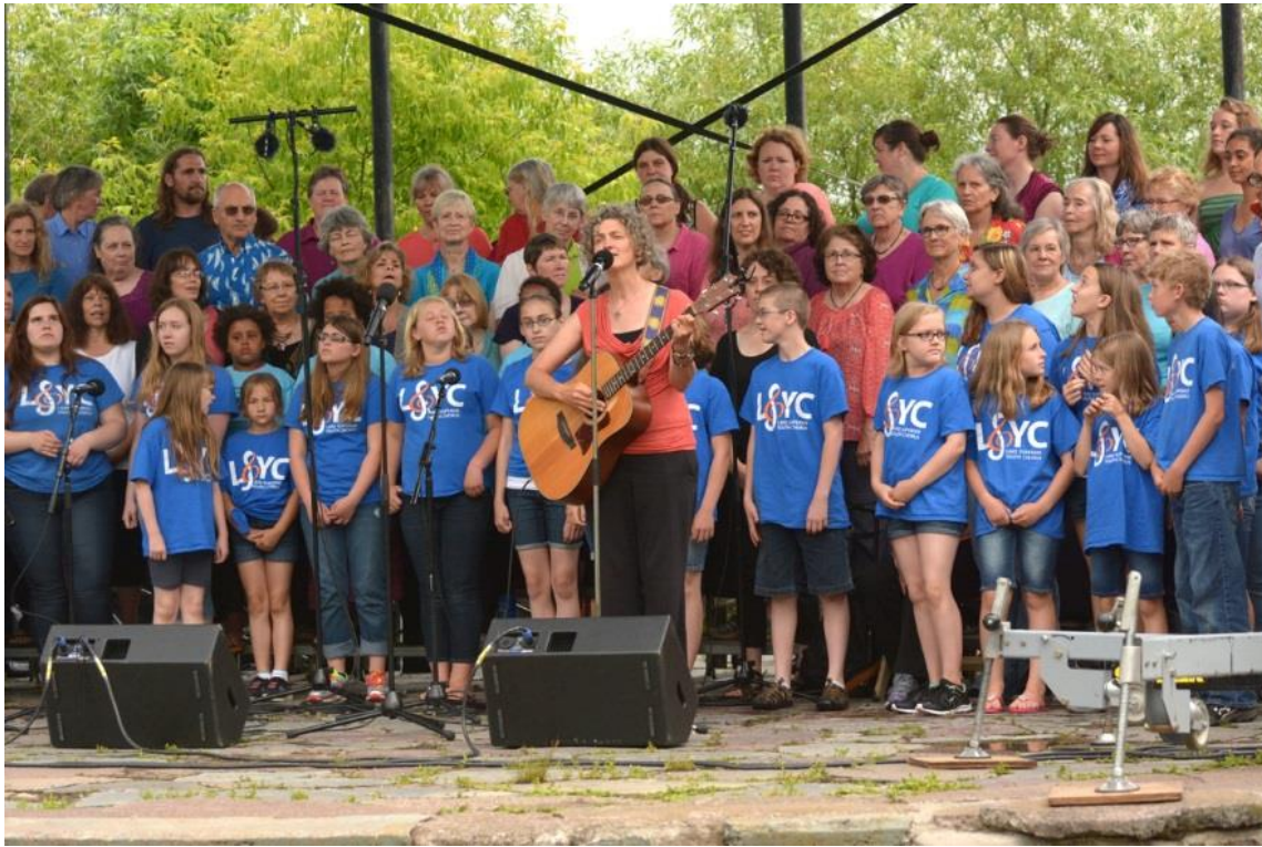
Members of three Duluth choirs take the stage at Harmony in the Park at Leif Erickson Park in June, 2015.

Harmony in the Park enhances Minnesotans' access to live arts experiences through a family-friendly outdoor choral festival series. Free and open to the public, two Harmony in the Park events in fiscal year 2015 convened some of the state's finest choral ensembles to fill summer evenings with song. In total, fiscal year 2015 Harmony in the Park events had more than 2,500 attendees and featured six Minnesota choral ensembles including more than 200 individual singers.