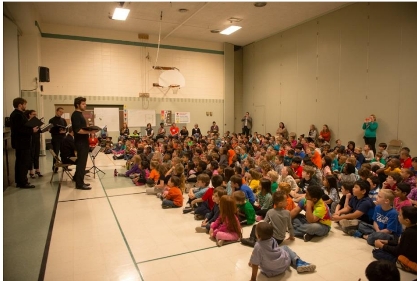
The Mirandola Ensemble, a choral ensemble based in Minneapolis, visited Oak Grove Elementary in Bloomington in October 2014.

Classical MPR's Class Notes: Artists program gives elementary students the opportunity to observe and learn from professional musicians by embedding regional classical music ensembles in local community schools. Musical artists come to schools to offer live, in-school performances and age-appropriate educational presentations. In support of artists' visits, teachers are provided with related curricular materials, and students receive online access to music from the artists who visited their school and other classical artists from Minnesota. In fiscal year 2015, more than 27,500 students in 60 schools across the state experienced a live performance and educational presentation from one of eight Minnesota classical ensembles.