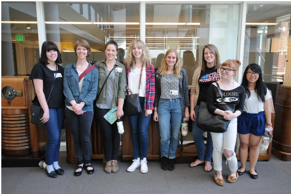
A group of Local Current Blog student writers gathered at MPR in April 2015 for a day-long training session in music journalism.

The Local Current Blog features the writing and photography of students from across Minnesota through the College Contributors program. Students build their journalism skills by working with Local Current Blog writers and editors and attending a day of training in music journalism at MPR. Their contributions offer audiences new perspectives on local music – including campus music news, live events and music scenes from Minneapolis to Morris to Winona. In fiscal year 2015, more than 250 Local Current Blog posts featured work by 30 student writers and photographers, representing a total of nine different Minnesota colleges.