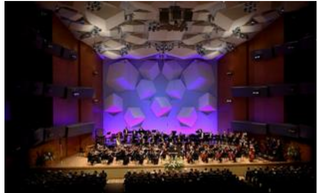
Minnesota Orchestra

Across Minnesota, more than 150,000 listeners each week count on Classical MPR as their window into the rich musical community that calls our state home. Through MPR's Classical Broadcast Performance program, dedicated staff traverse the state to identify and record for broadcast classical concerts of regional importance. With classical recordings and broadcasts from Twin Cities organizations like the Minnesota Orchestra, Saint Paul Chamber Orchestra and Minnesota Opera, as well as performances in communities across Minnesota—including St. Cloud, Winona, Rochester and Duluth—in fiscal year 2015 Classical MPR provided statewide audiences with a total of 128 recordings for broadcast and 81 real-time broadcasts of live Minnesota classical performances.