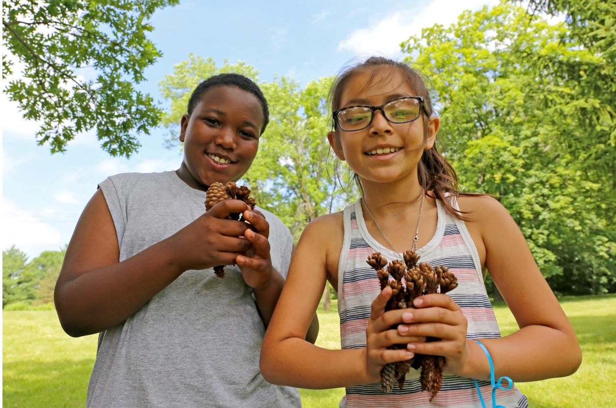
Minneapolis Public Schools summer school students explore Fort Snelling State Park and collect pinecones for their nature art activity.