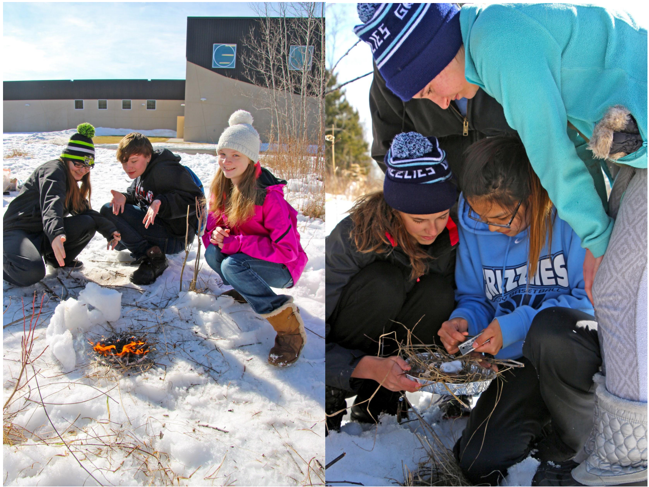
On campus at North Woods School in Cook, Minnesota, high school students learn about Minnesota's history as they use flint and steel to start fires during an activity rotation.