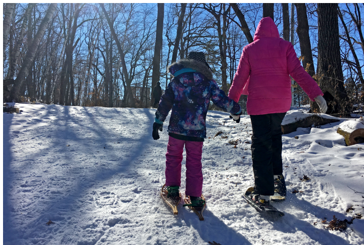
St. Cloud 5 th grade students snowshoe on the campus of Saint John's University in Collegeville.