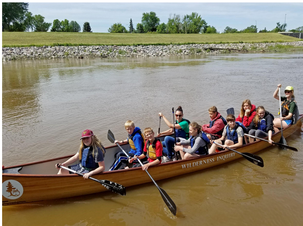
Students from Crookston paddle in the Red River Basin.