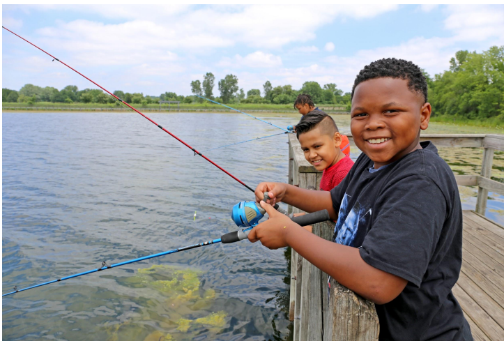
Minneapolis summer school students fish at Fort Snelling state park.