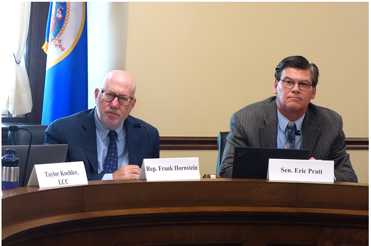
State Rep. Frank Hornstein and state Sen. Eric Pratt shown leading a meeting of the Metropolitan Governance Task Force.