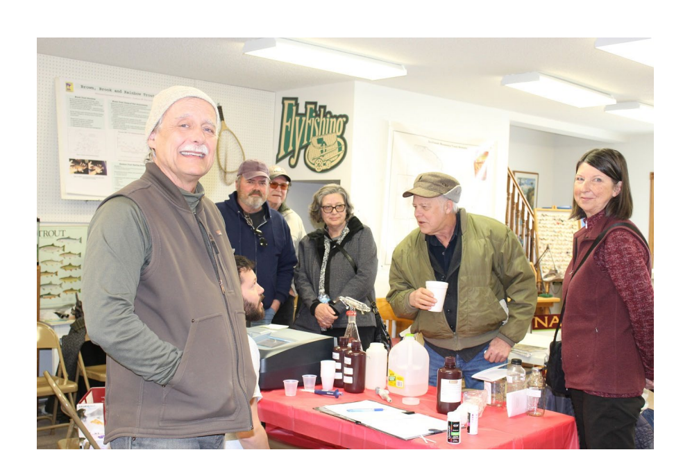
pre-covid water testing clinic in Preston, MN testing nitrates from private wells